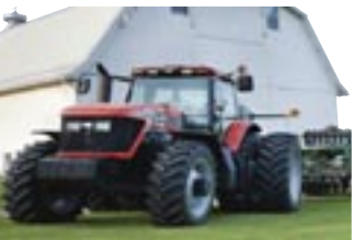
PHOTO plus CLASSIFIED Sell your stuff in the classifieds!

15 words or less for $50 (*50¢ each additional word. *45¢ without a photo.)